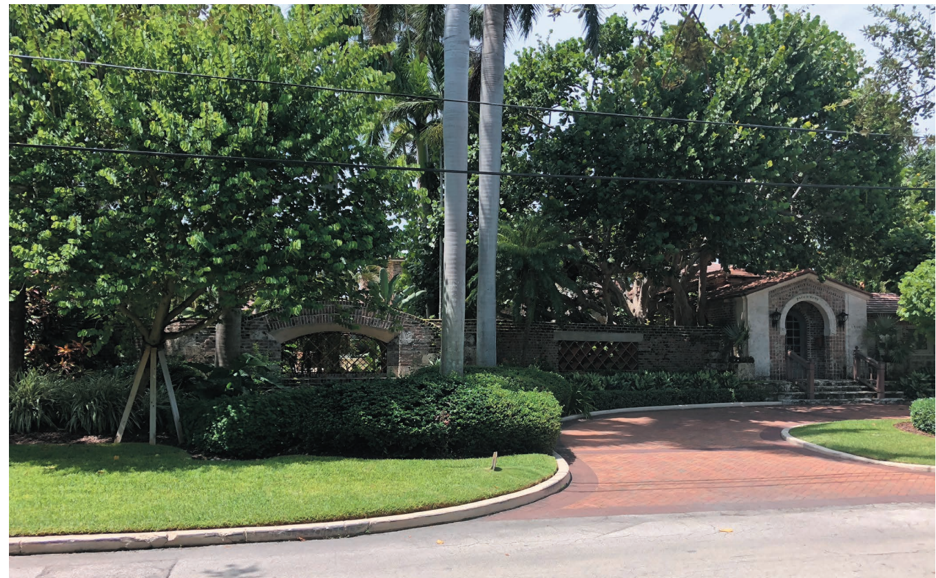
2 STREET VIEW - ADJACENT PROPERTY