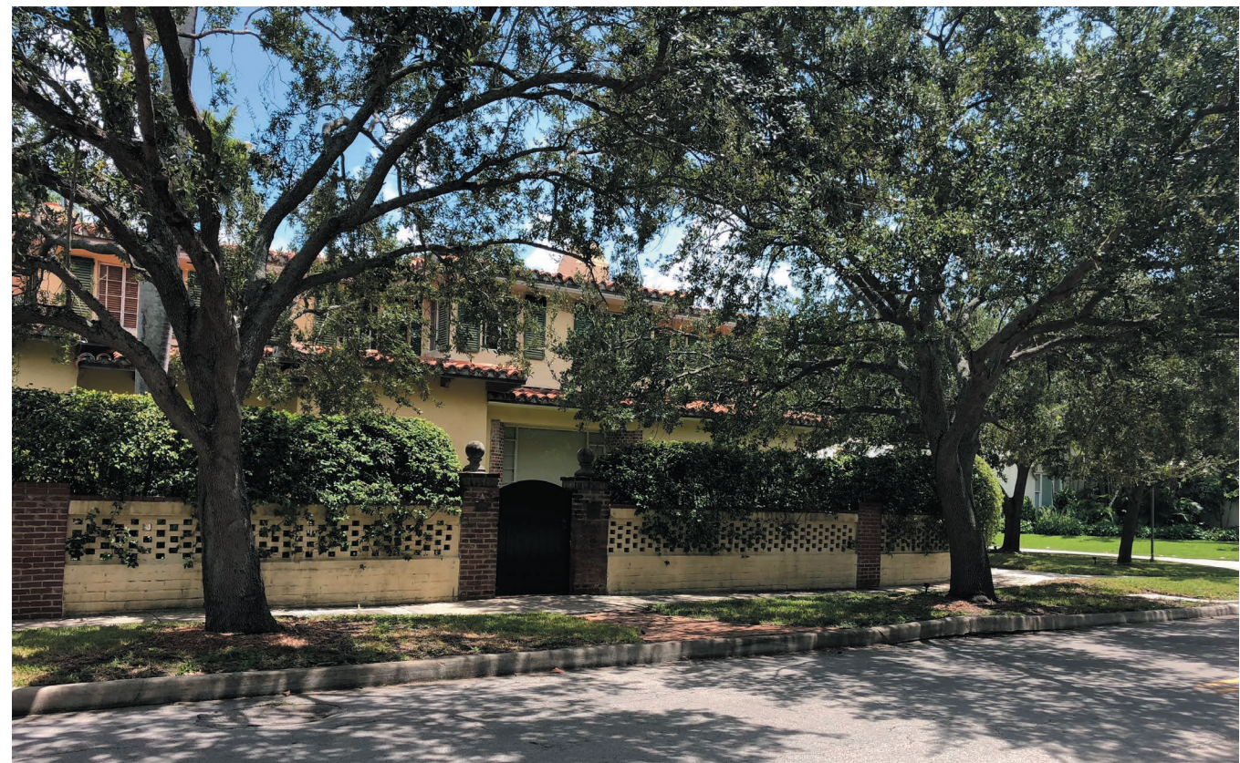
3 STREET VIEW - ADJACENT PROPERTY