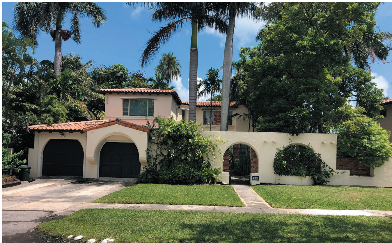
⑤ STREET VIEW - ADJACENT PROPERTY