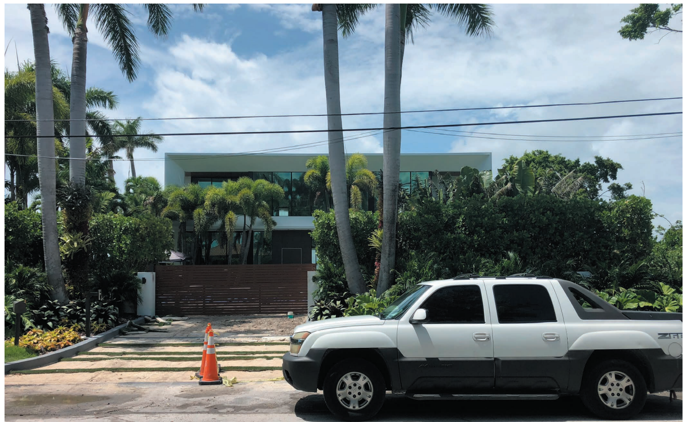
⑥ STREET VIEW - ADJACENT PROPERTY