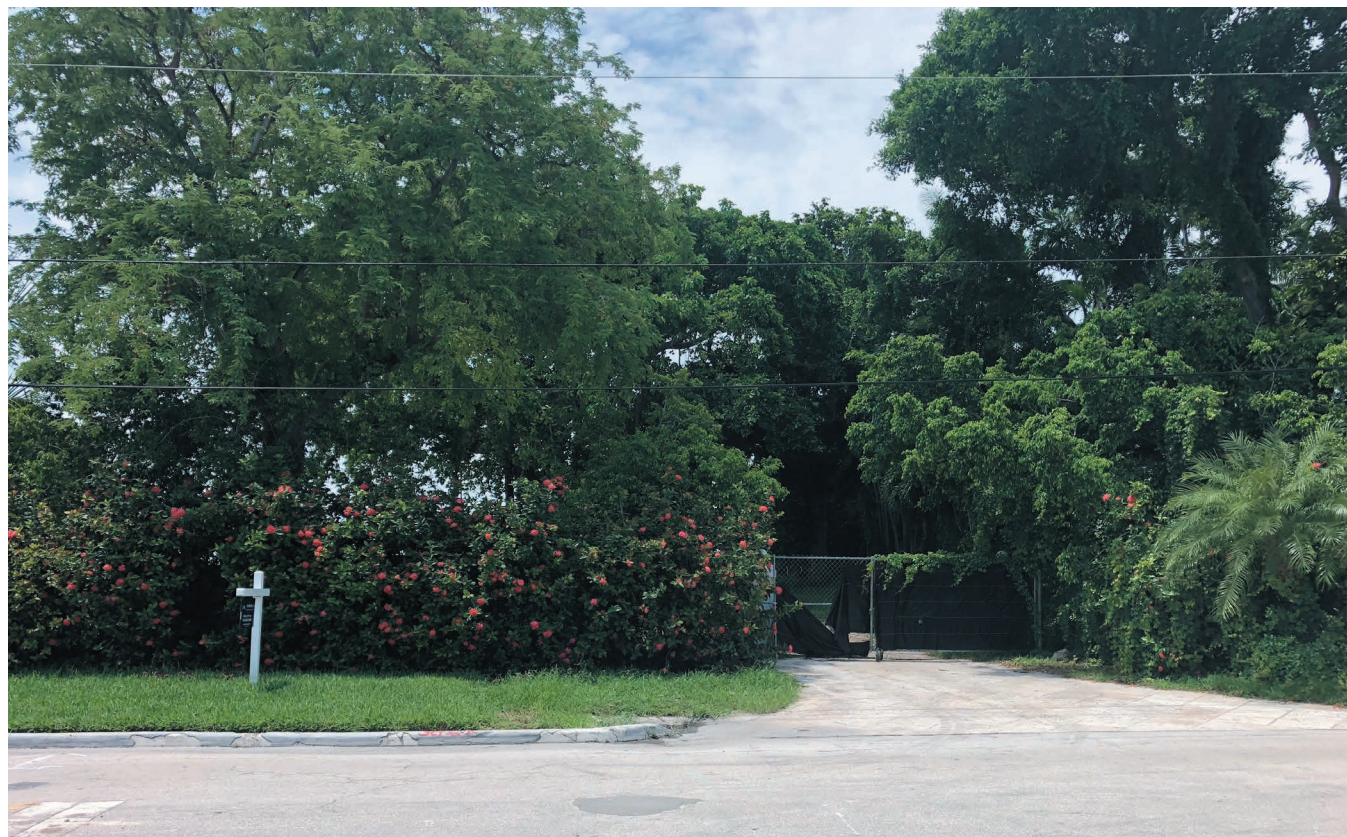
1 STREET VIEW - 5860 N BAY RD