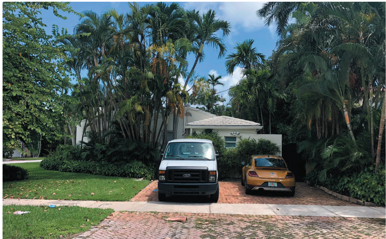
④ STREET VIEW - ADJACENT PROPERTY